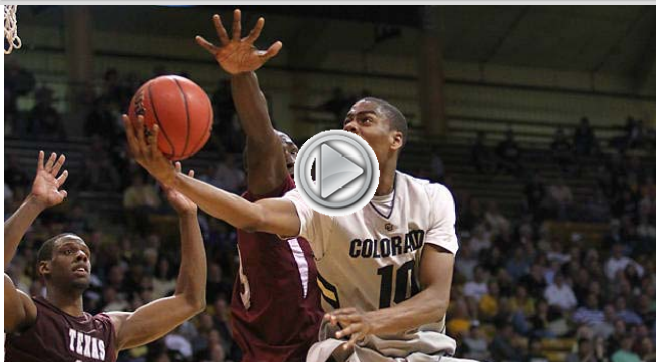
Alec Burks scores two of his game-high 27 points.